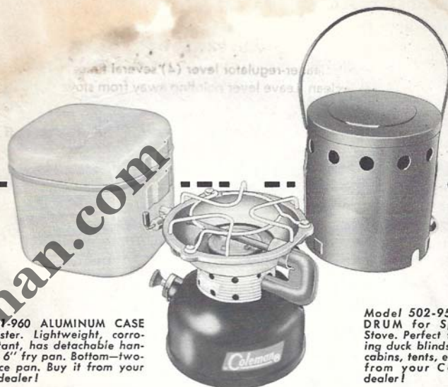
Model 501-960 ALUMINUM CASE for Sportster. Lightweight, corrosion resistant, has detachable handle. Lid is 6" fry pan. Bottom—two-quart sauce pan. Buy it from your Coleman dealer!

Close shut-off valve (1) by turning valve wheel to the right. Unscrew filler cap (2). With stove in level position, fill with clean, fresh fuel. Fount holds approximately one pint. Replace filler cap and tighten firmly with fingers. Never remove filler cap while the stove is lighted.