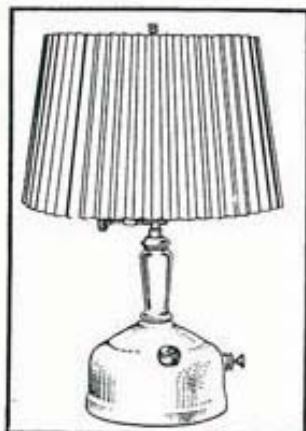
Model 152, 152A